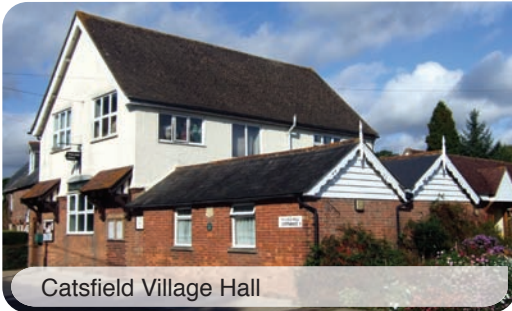
Catsfield Village Hall