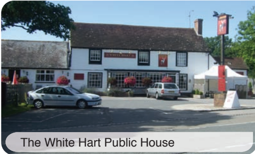
The White Hart Public House