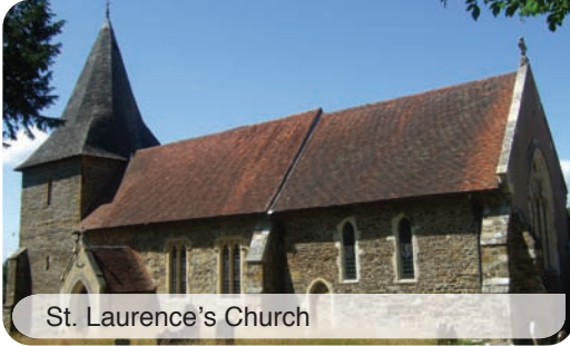
St. Laurence's Church