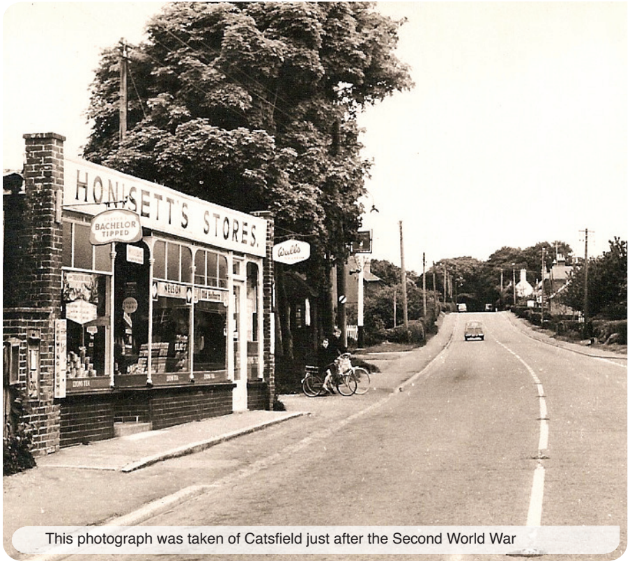
This photograph was taken of Catsfield just after the Second World War