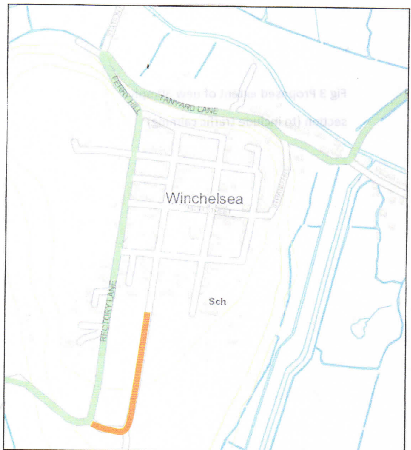
Fig 3 Proposed extent of new 30mph section (to include traffic calming)