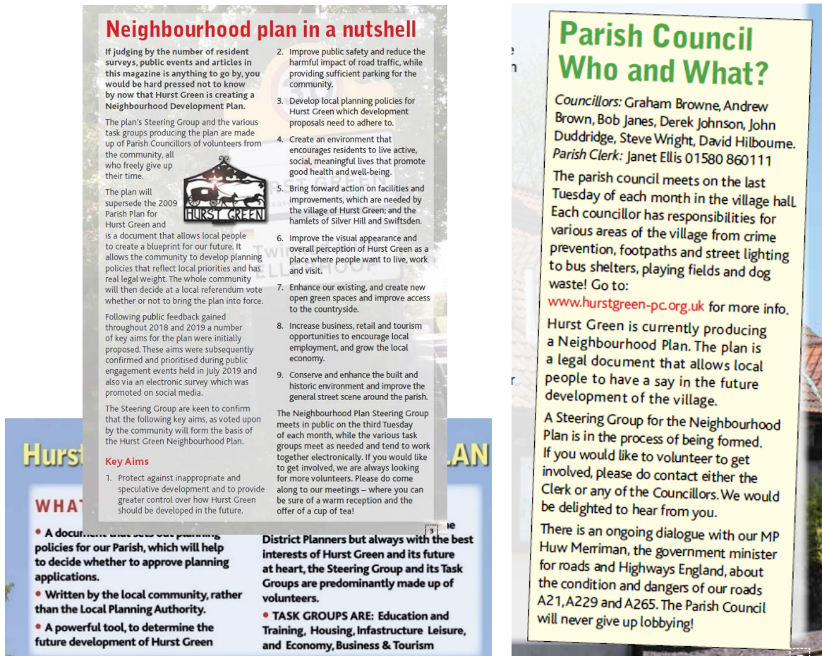
A selection of articles from the newsletter, theHurst