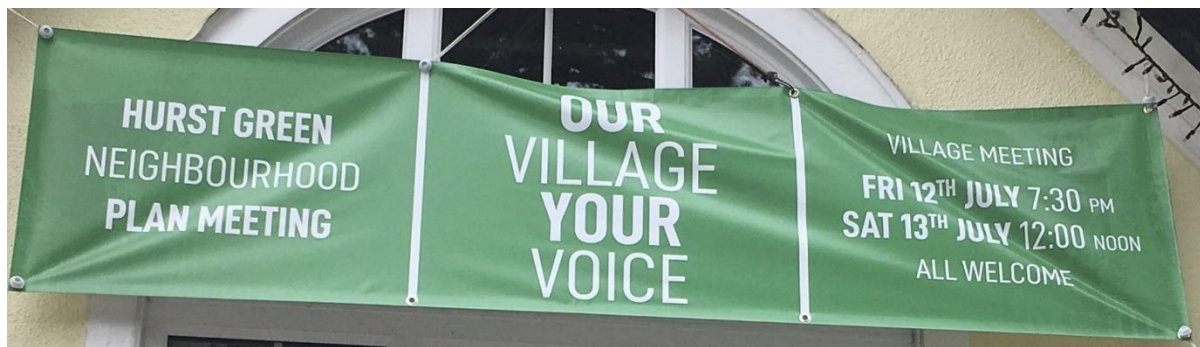
Banner promoting the Aims, Vision and Objectives workshops