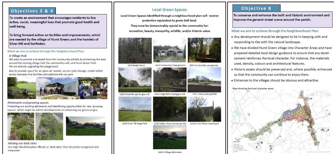
Examples of the displays from the October 2021 Exhibition