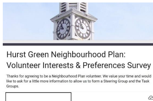
Online survey aimed at recruiting volunteers depending on their interests