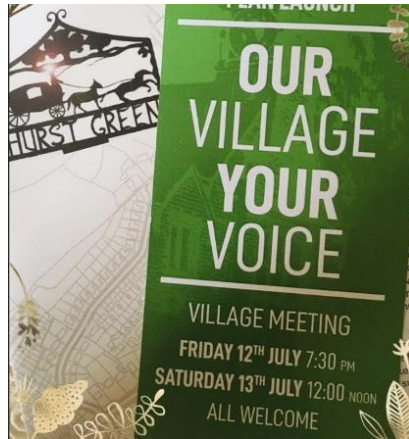
Poster advertising one of the village update meetings to share progress on the HGNP