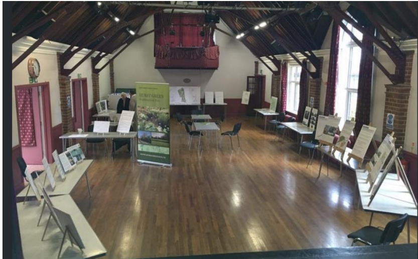
Photograph showing the layout for the October 2021 policy exhibition prior to the event opening