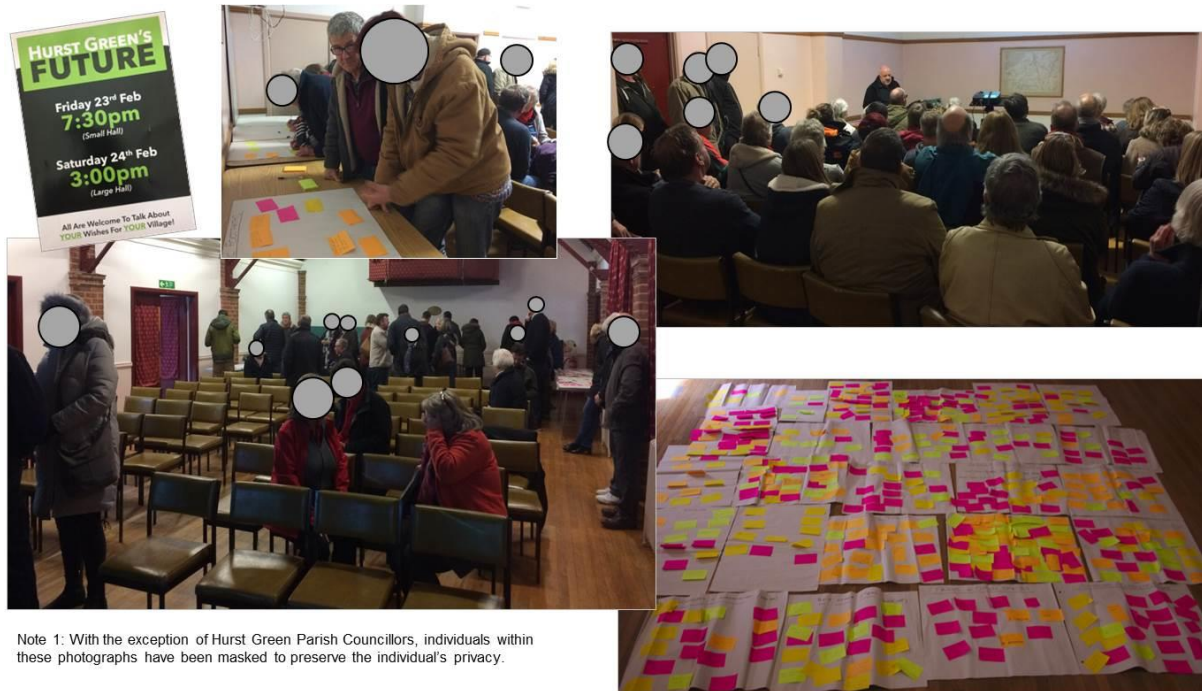
Photographs from the two Kick-Off events, February 2018

2.6. A Terms of Reference (Appendix A) was drawn up by the Parish Council to be considered by the Steering Group, once formed. A Volunteer Information Evening was held on 17 April 2018 to share feedback from the launch events, to talk through the stages of the neighbourhood plan and to seek volunteers to join the Steering Group. This led to 12 people volunteering onto the following Task Groups: