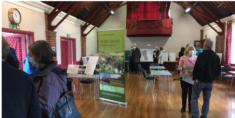
Photograph of Parish Councillors speaking with members of the public at the exhibition