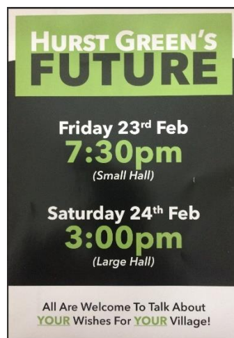
Flier distributed to all households promoting the HGNP launch events