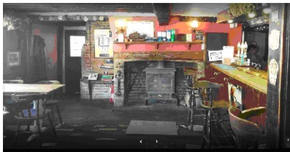
The Swan at Woods Corner

Brightling's local pub is The Swan at Woods Corner, Dallington TN21 9LB. enquiries@swaninndallington.co.uk 01424 838242